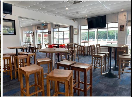
Rattan Lounge & Bar Area